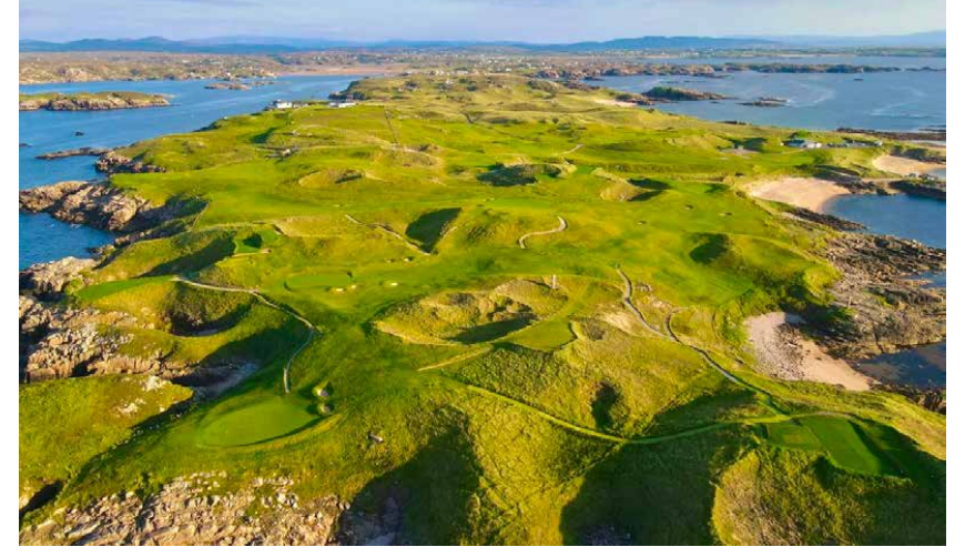
Nearby is the nine-hole and vastly entertaining Cruit Island Golf Club.

St. Patrick's is full of nice little touches. Check out the deep hollows among the dunes on 10, 17 and 18. They were even deeper when Doak first spotted them. He filled them in somewhat just so they could maintain grass and be playable. And he's